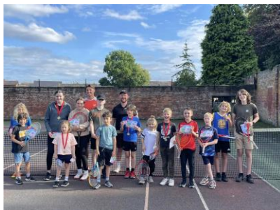
Competitors at our September US Open style tournament